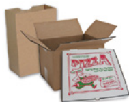
Cardboard & Paper Bags Flatten cardboard & cut into pieces. No wax coated cardboard