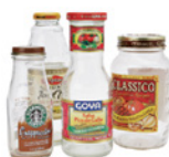
*Clear and Colored Glass Empty containers only