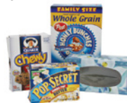
Paperboard No wax coated paperboard