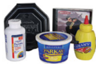
*Household Plastic (#3-#7) Empty containers only