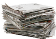
Newspaper Remove bags, strings and rubber bands