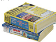
Phone Books All types and sizes