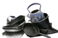
Pots & Pans Kitchen cookware