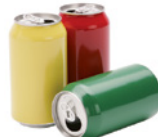
*Aluminum Cans Empty cans only