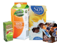
Paper Milk or Juice Cartons Empty cartons only