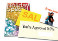
Junk Mail Envelopes, flyers, brochures, postcards etc.