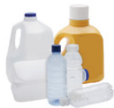
*Plastic Jugs/Bottles (#1 & #2)