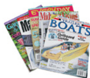
Magazines & Catalogs Any size magazine