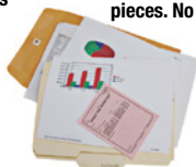
Office Paper All types and sizes